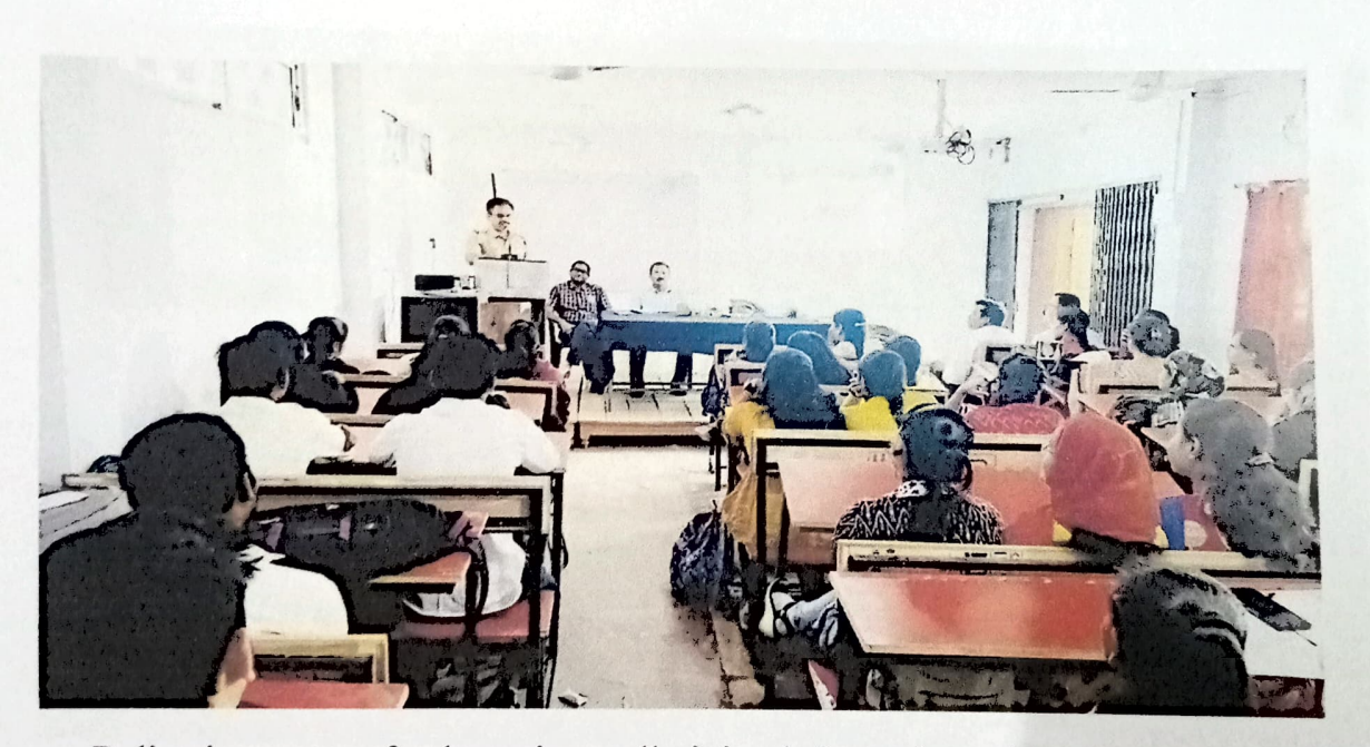
Police inspector of cyber crime cell giving information while creating public awareness of cyber crime program