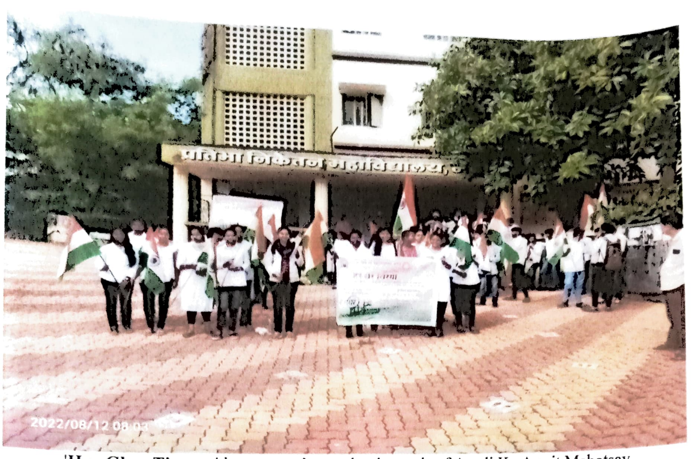
'Har Ghar Tiranga' is a campaign under the aegis of Azadi Ka Amrit Mahotsav