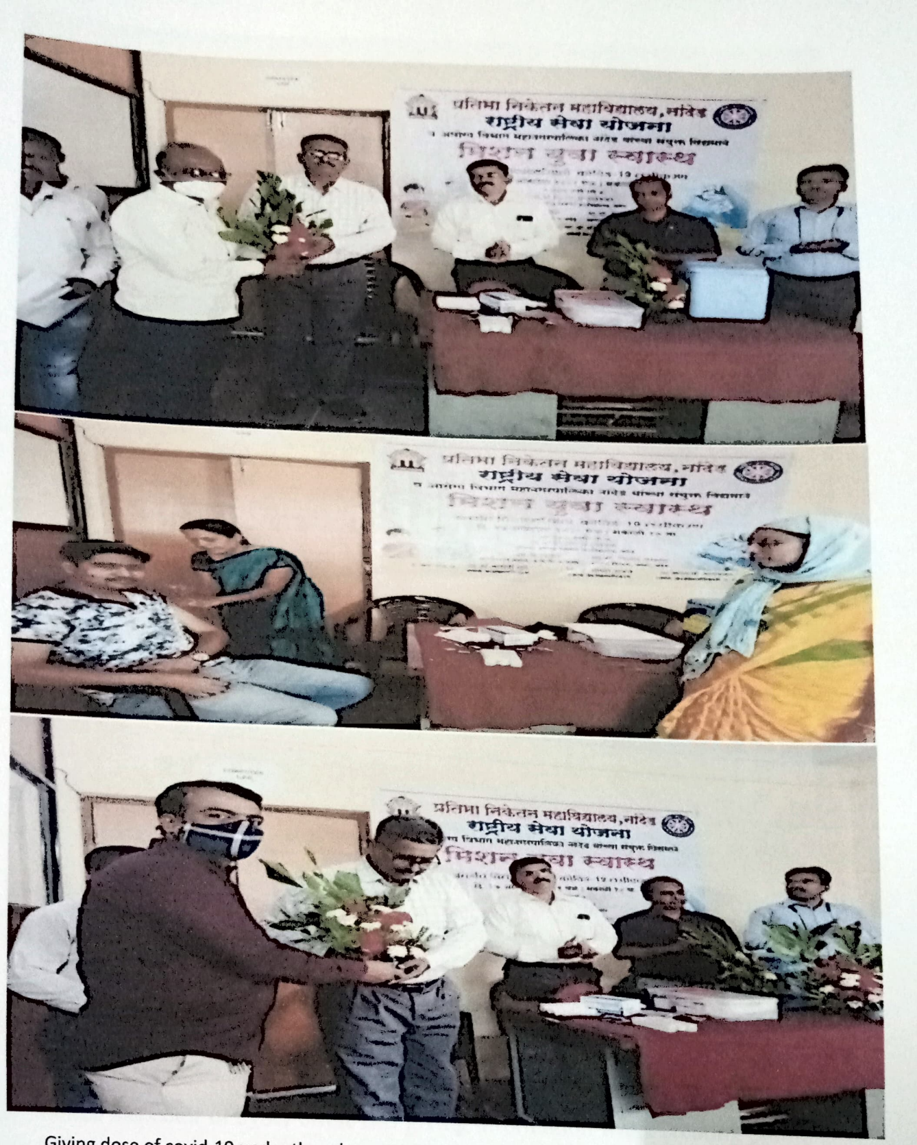
Giving dose of covid-19 under the scheme Mission Yuva Mission through Municipal Corporation