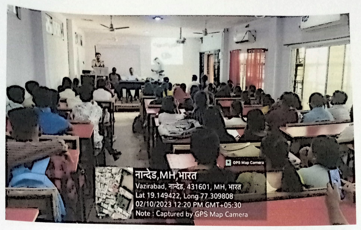
Police inspector of cyber crime cell giving information while creating public awareness of cyber crime program