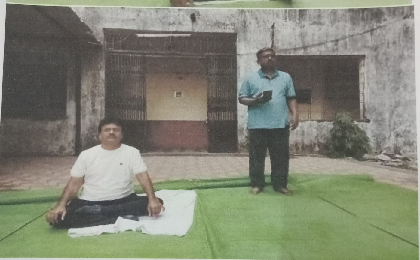
21 June international yoga day