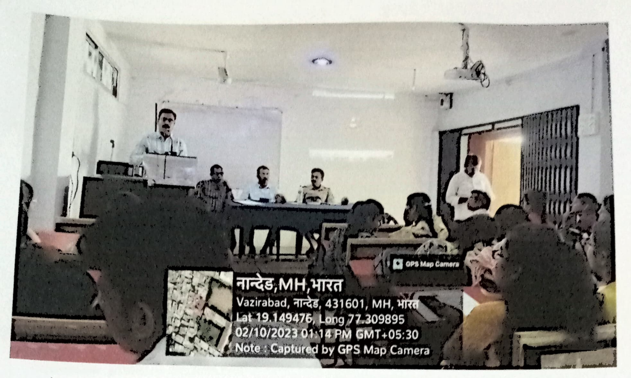
An awareness program on cyber crime was organized for college students